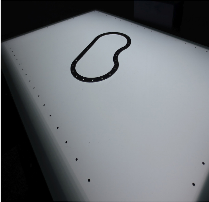
Figure 2: Typical part being measured on the Planar at TT Gaskets.

To find out more information about the Planar and how it can help your business; please download our online brochure and contact our sales team at sales@inspecvision.com .