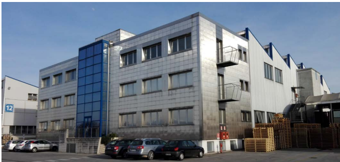
Figure 1: Verona Lamiere factory in Italy

Verona Lamiere are a sheet metal processing company, with welding, cutting, bending and stamping departments. The company is based in Italy and were founded in 1989. Their clients include many high profile names such as “Schneider Electric Group, Electrolux Group and CNH Group” so high quality standards are essential.