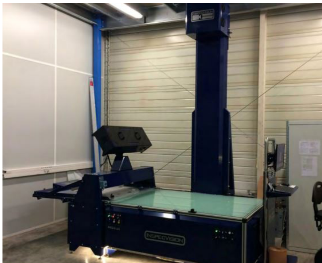
Figure 1: P220.35 with Surfscan and Opti-Scan installed at SGC.

Société Giennoise de Chaudronnerie (SGC) was established in 1978 and specialises in precision sheet metalwork. The company is based in the central Loire Valley region of France and services a wide range of industry sectors including HVAC, aerospace, household and industrial appliances, automotive, defence and lighting. The company offers both small and large volume manufacturing to its customers with production methods including punching and shearing, laser cutting, pressing, bending, deburring and surface treatment. Assembly, packaging and labelling services are also available.