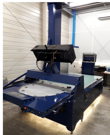
Figure 2: Opti-Scan 3D Automated Turntable - pushed back while Planar 2D is being used.

Mr. Huteau commented that the Planar machine is easy to use and “every operator can use it if it’s already programmed. For a new programme it’s less easy for everyone but quite simple when you’ve had the complete training”. Every operator who has completed a basic training with their technician uses the machine.