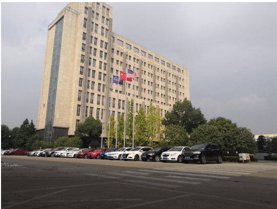
Figure 1 & 2: Outside the HBTC company in China

Products include engine parts for customers such as Rolls-Royce, Airbus, Boeing, Collins Aerospace and Comac.