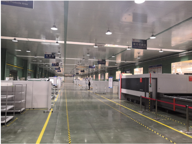
Figure 4: Inside the HBTC plant.

HBTC has installed a broad range of sheet metal equipment from leading manufacturers including Amada, Prima Power, Salvagnini, Makino and DMG MORI and has achieved ISO9001, AS9100 and NADCAP quality management system certification.